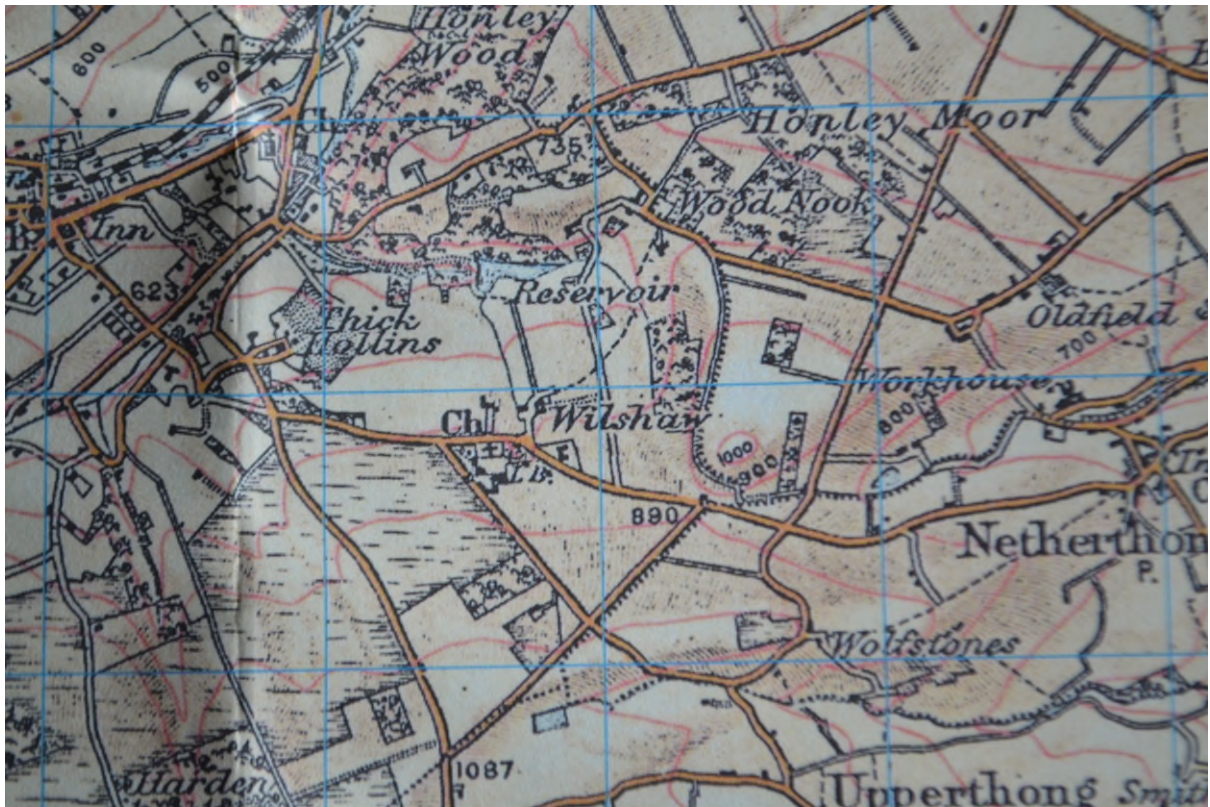
E14 1 inch Ordnance Survey Map (Revised New Series, dated 1903) (facsimile edition published by Cassini, extract supplied with application 1)