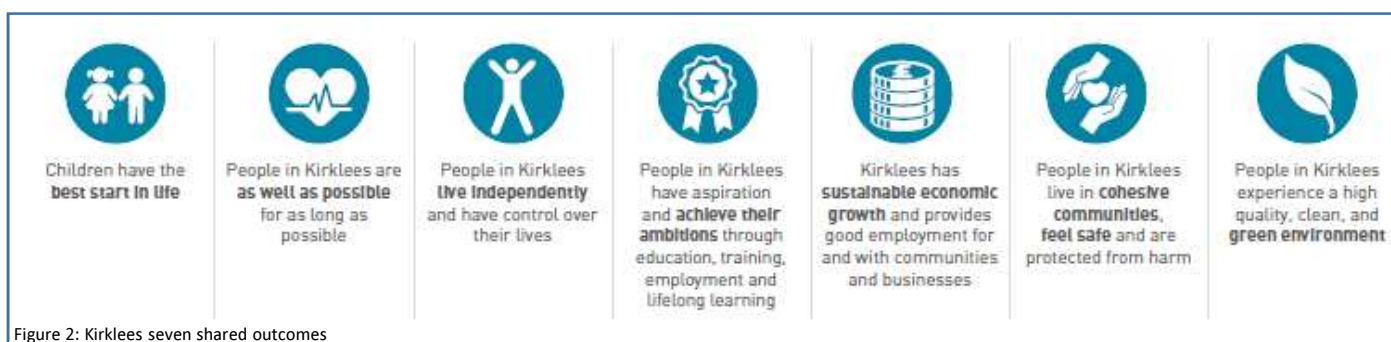
Figure 2: Kirklees seven shared outcomes

The following outcomes have been developed with the Council's partners in the public, private and voluntary sectors across Kirklees. Seven target outcomes have been produced for Kirklees. In defining measures of success for Procurement at Kirklees, we are considering how Procurement can help deliver these outcomes.