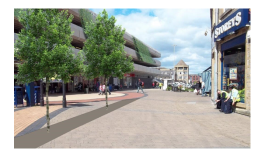
Macaulay Street – Existing and Potential

2.9 Hostile Vehicle Mitigation (HVM) measures also form part of the HTCDF. Protective security measures for crowded places are considered as part of the design process and features in Highways new build or refurbishment projects. Counter-terrorism measures and increased safety features such as HVM planters also enable dual functionality such as enhancing and greening the street environment. Trees in such planters, together with structural artwork/framework, could potentially also support Christmas lights in winter for example. They also