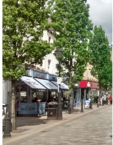
Halitax Iown Centre fastigiate trees

attract shoppers and visitors, improving pedestrian footfall and volume of public, customers and workforce.