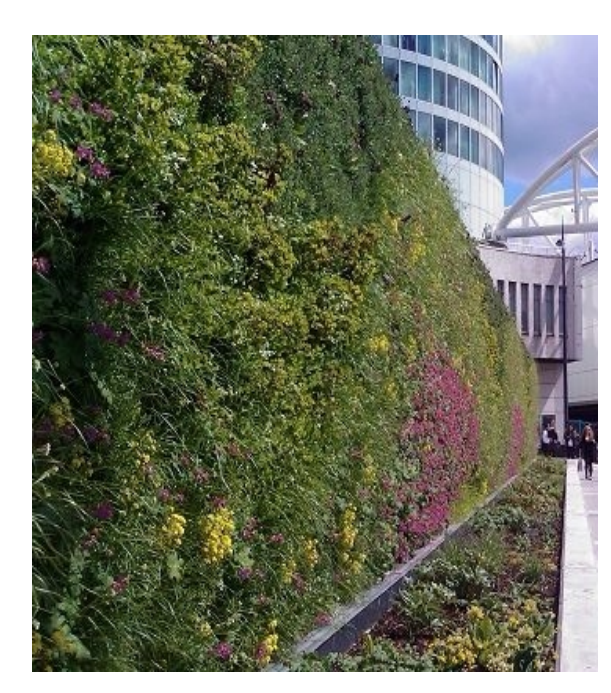
Green Wall Birmingham –Potential

2.4 It has been recognised that we need to ensure standards are increased generally throughout the town. The preparation of the Huddersfield Town Centre Design Framework is the result of collaboration between many departments and a successful multidisciplinary approach. This document aims to ensure any proposed development of the public realm would meet the agreed underlying principles to support strategic objectives, including those of community safety, for the town, provide a consistent approach, ensure safe designs and that materials specified for the public realm will be of sufficient quality and consider long term condition. Lighting principles and the improvement of the