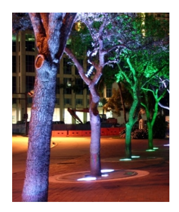
Lit street trees – Potential

2.3 At present there is no real mechanism for ensuring quality and consistency of approach across the town with some recent projects attracting mixed reviews for their appearance and impact on the public realm. The development of the Green Streets® strategy for Kirklees, identified the need for a more cohesive approach within the town centre. The variety of styles, materials, colours and furniture types further compromise the attractiveness of the town. There is currently no guidance or framework setting out the principles or specification for materials or quality and this is key in order to support the public realm associated with delivery of key highway refurbishment schemes and regeneration/ development such as sites like the Piazza and the rail station.