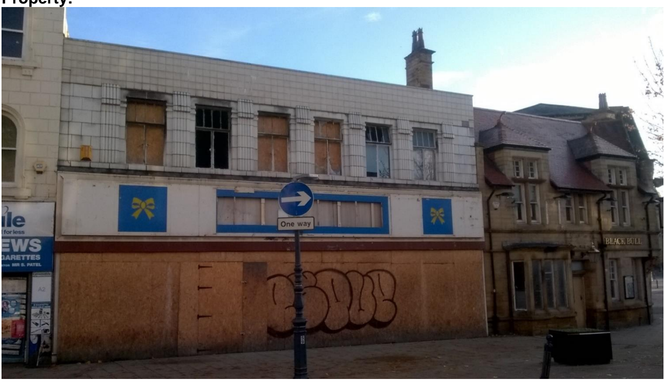
Dewsbury Townscape Heritage Initiative – 30<sup>th</sup> November 2018