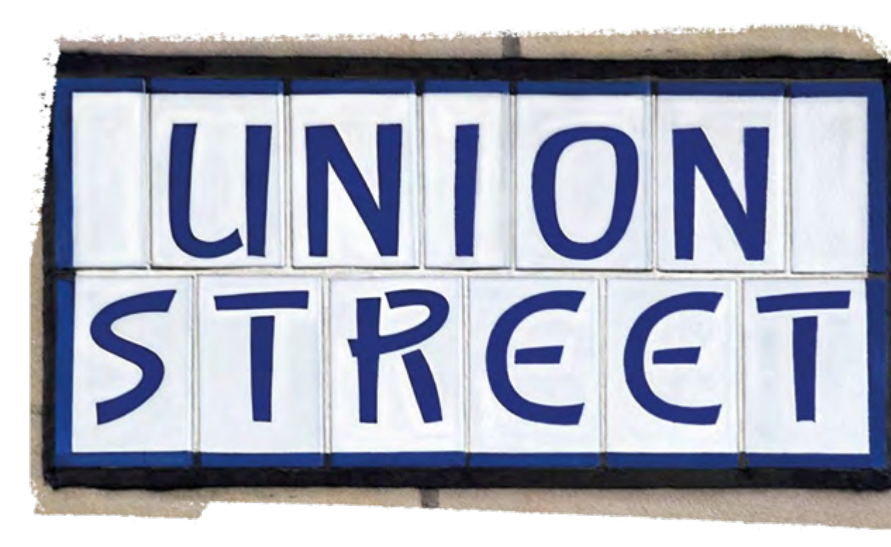
Tiled Street Sign, Northern Quarter, Manchester

There are regulations around much public signage in the public realm, so consideration needs to be given to this as well as to ensure signage is legible and fulfils its principle purpose.