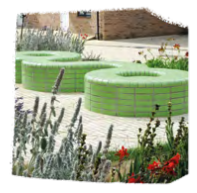
'Seed' Lubna Chowdhary – Glazed brick benches, Orchard Park Estate, Photo: the artist