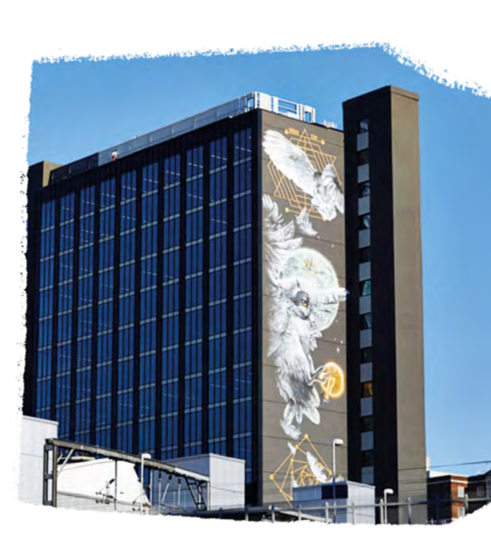
'Athena Rising', Nomad Clan, Leeds