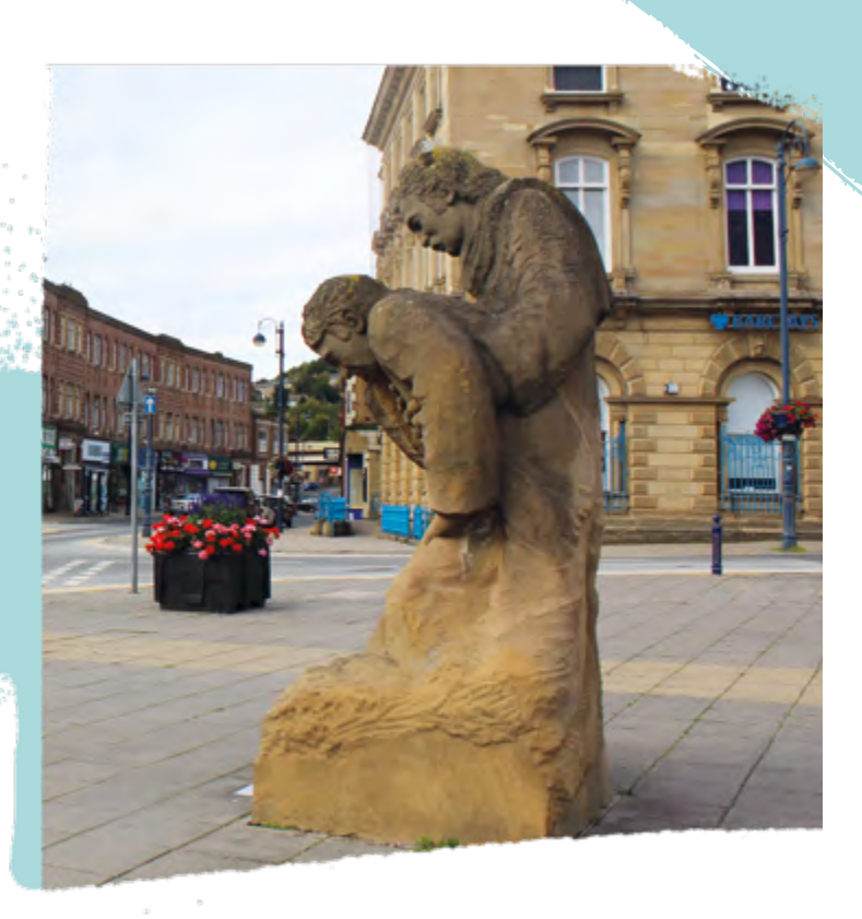
'The Good Samaritan' by Ian Judd