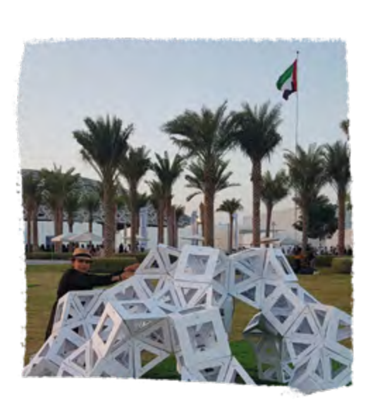
Installation (2018) Folded Cardboard Polyhedra – Saba Rifat