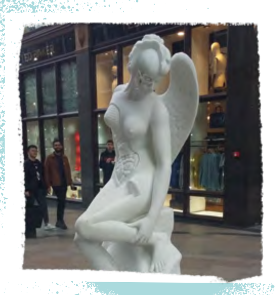
Damien Hirst, 'Hymn', Leeds, Yorkshire Sculpture International

As the artworks are not intended to last, physical works can be vulnerable to damage, intentional and unintentional. There needs to be excellent community engagement to ensure the value and process of the work is understood. Sometimes temporary works are loved so much there can be a demand on the council to make the work permanent, an example being the Gormley installation Another Place at Crosby Beach.