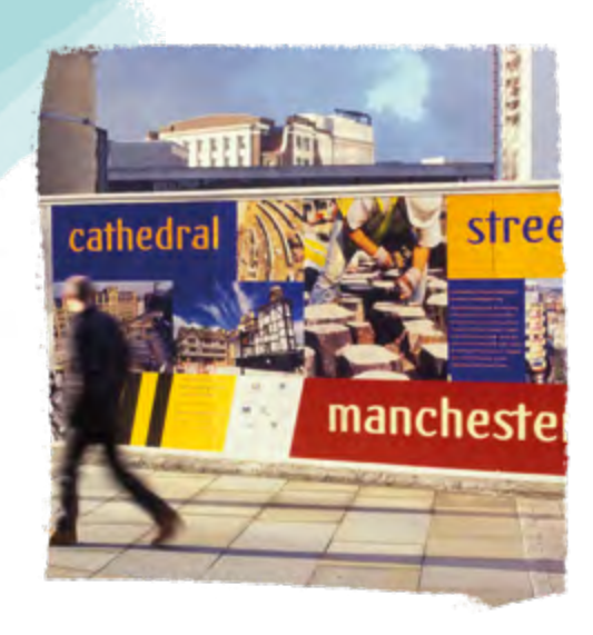
Temporary Hoardings showing work underway and history of the site; Artist & Photo Len Grant