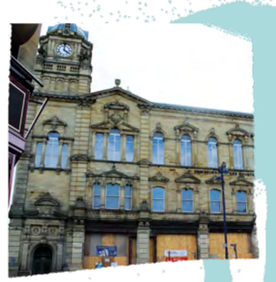
Illuminos: Projection Mapping, Bournemouth