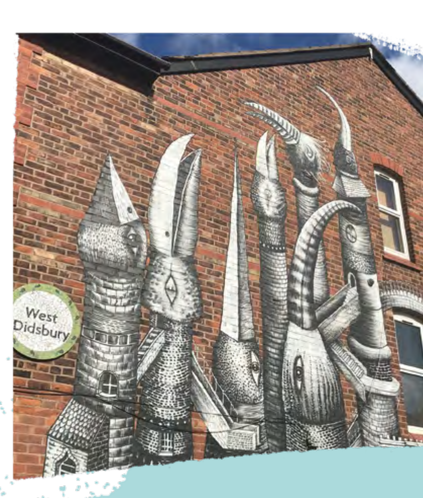
'The Bird Towers', Phlegm, West Didsbury

Even if intended to be temporary, it can cost a lot to prepare surfaces, design and fabricate and install securely. It is important to have an idea of the future plan for the building so a realistic life span can be estimated for the work before preparing the brief.