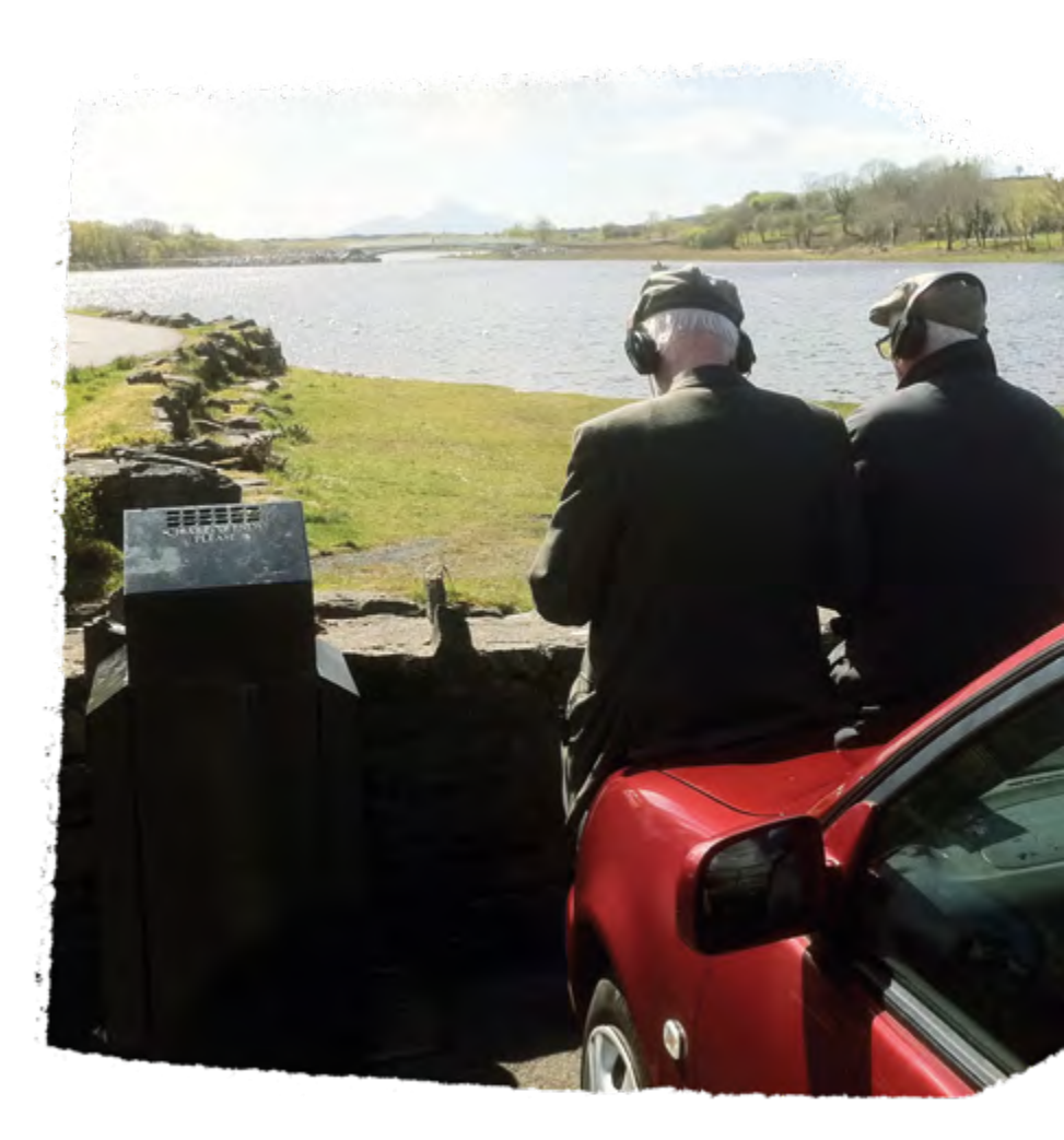
The Performance Corporation 'Across the Lough' – a performance on a boat listened to via an iPod from the water's edge

Think about documentation and how the work can be experienced by people not able to attend, for example live streaming, filming or recording the work. It is important to ensure the safety of performers as well as audience members so risk assessments and enough support staff need to be in place.