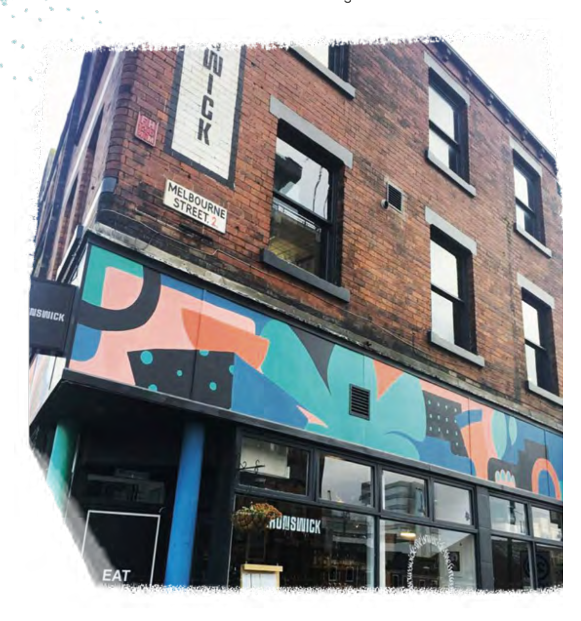
Painted Street Frontages

Commissioning special street signs within the area would serve to reinforce this identity or special events and weekends, handmade bunting could be commissioned to be strung around this area.