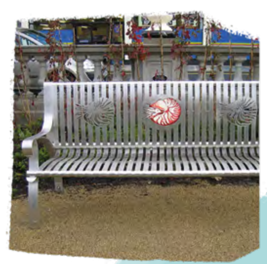
Nautilus Seat, Southport Artist: Kate Maddison, Chrysalis Arts

Market Place a large expanse with a pergola, existing planters and street furniture. Like the Town Hall Square, it is used as a main space for events and the site links to the town hall square across the roadway. As an events space, there is a need to retain flexibility, and for any artworks here to create an environment with good sight lines.