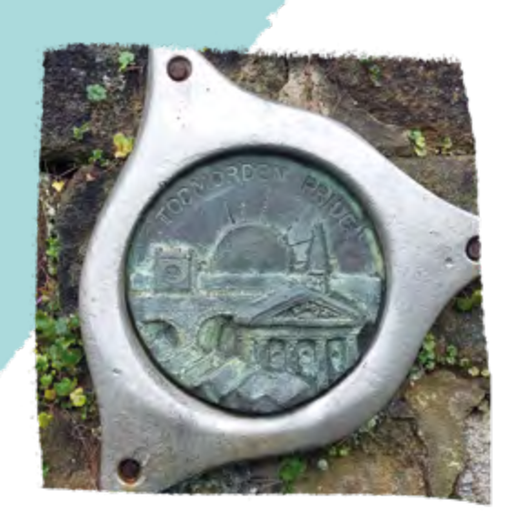
Route Markers, Todmorden Canal Path